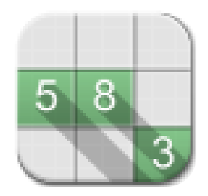
5: Abstract data structures