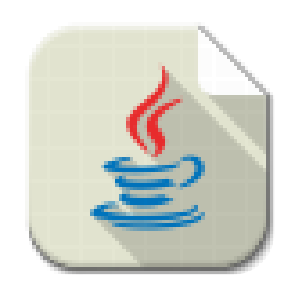
4: Computational thinking