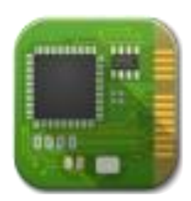
2: Computer Organisation